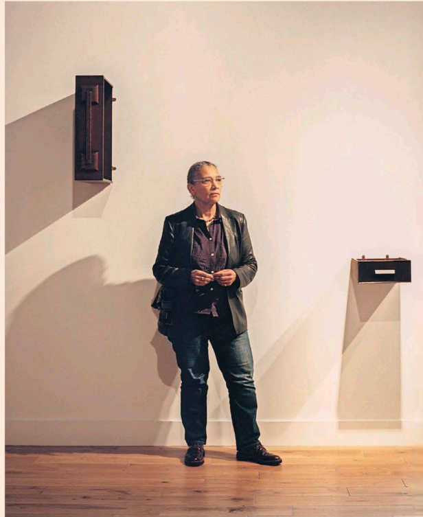
Above: Lubaina Himid at HOME in Manchester.

"Manchester lacks the green spaces you find in London," Himid observes as she escorts me through the show which, she hopes, will reveal sides to the city that have slipped under the radar.