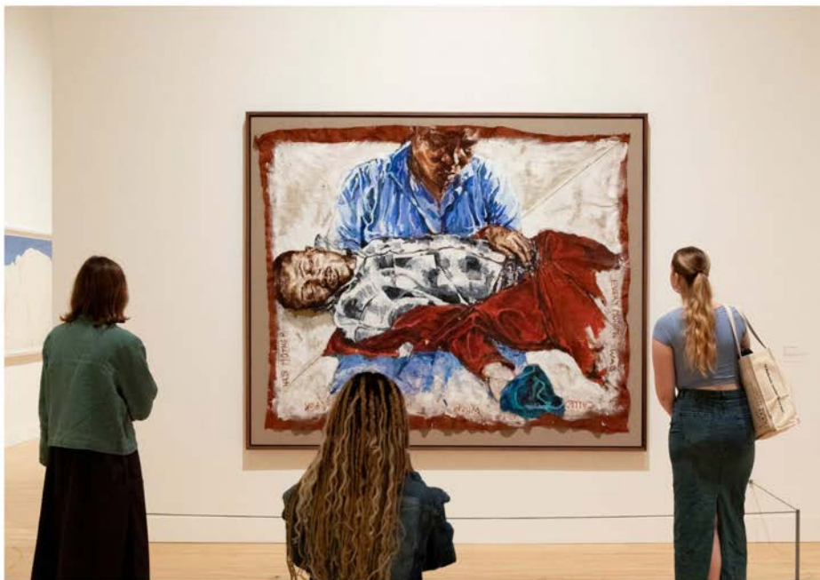
Installation view of Claudette Johnson, Pietà in "Turner Prize 2024" on view at Tate Britain from September 25, 2024–February 16, 2025.

Johnson's piece also comes at an ideal time for Art on the Underground, as she reaches a new height in her career. The artist had two major solo shows, " Claudette Johnson: Presence " at the Courtauld Gallery in London and " Claudette Johnson: Drawn Out " at Ortuzar Projects in New York, both of which bagged her a career-defining Turner Prize nomination this year.