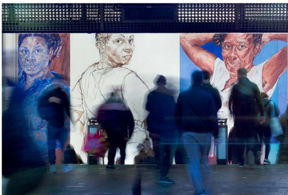
Three Women.

Trilogy (1982–6) is a similar triptych of Black female figures dressed in blue, black, and red, though in that instance, "I just asked them to stand in ways that were reflective of who they were," she explained. "Whereas in this one, it is not about reflecting who they are [because] it's projecting my response to that work by Picasso."