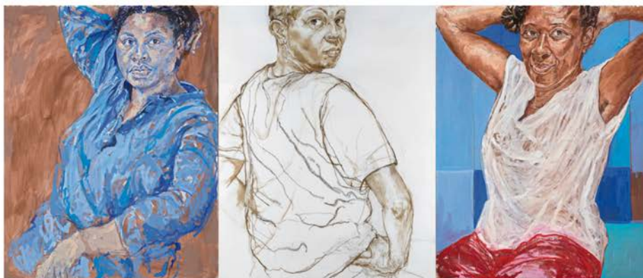
Three Women, 2024.